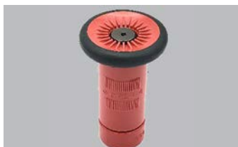
Fire Hose & Nozzle